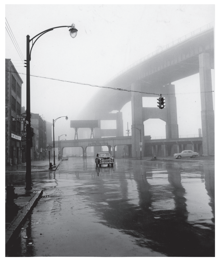
Figure 7: A "noir" image of the Skyway, May 13, 1958.

(1956–), including the system's signature cloverleaf interchanges, identified by one historian as "the most vivid symbol of the biomorphic awareness. . . . " The sense of flight that motorists experienced while traversing the Skyway, and that one could sense from beneath the structure, links the bridge to more famous structures identified with the vital forms phenomenon, including the Gateway Arch (designed 1948) and the Dulles International Airport, both Saarinen designs, and the New Haven, Connecticut hockey rink (1956–58) and the Trans World Airlines Terminal (JFK, 1956–62), both designs by David S. Ingalls. In words that