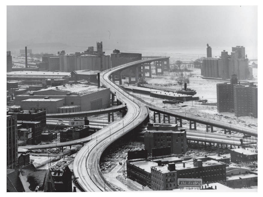
Figure 3: This 1962 winter view of the Skyway reveals the structure's four curves and its setting, between banks of grain elevators.