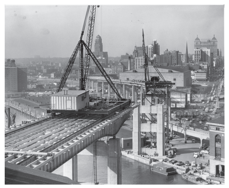
Figure 5: The Skyway under construction, April 14, 1955.

the structure in ways—ways embedded within mid-1950s American culture—that could not have been anticipated by the traffic engineers who had first imagined a high-level bridge and, at the turn of the next century, had been forgotten. Indeed, despite its utilitarian origins, the Skyway, like other "products" of what historian Thomas Hine has labeled the Populuxe era (1954–1963), was understood psychologically and celebrated emotionally. In January 1951, when work had begun with the driving of sixty-five steel test piles into the frozen ground off Fuhrmann Boulevard, the Courier-Express had called it a "day of rejoicing" and asked readers who "can't picture a bridge that high" to understand and appreciate its stature by thinking of it as equivalent to the five-story building that housed the newspaper's staff. Reporters could not resist the startling statistics that revealed the extraordinary mass of the structure: 5,904 feet long, 22,000 tons of steel deck, 10,000 cubic yards of concrete, 10,000 gallons of paint.<sup>39</sup>