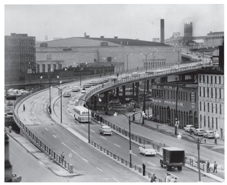
Figure 1: Looking south from downtown Buffalo, October 19, 1955, one hour after the official opening ceremonies.

of "Made in Buffalo" confirmed the city's role as a center of industry. Although fears that lack of effective leadership would consign the region to second-class status as a transportation hub had surfaced in the local press by the mid-1950s, the city's population was at an all-time high, the region was participating in the national economic boom, and the St. Lawrence Seaway, due to open in 1958, was generally viewed as a positive development. A prominent business leader predicted that, within a decade, employment in the Buffalo area would increase by about 50%.6