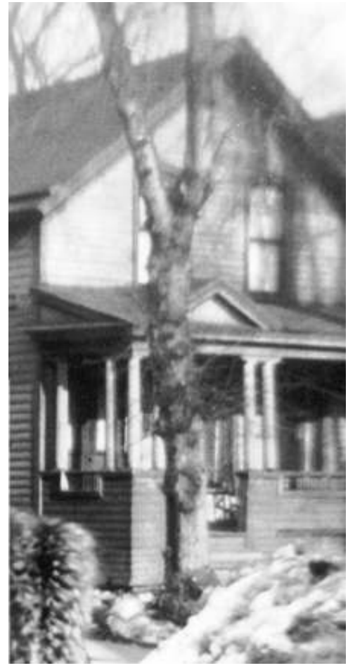
33 Plymouth Ave., circa 1945