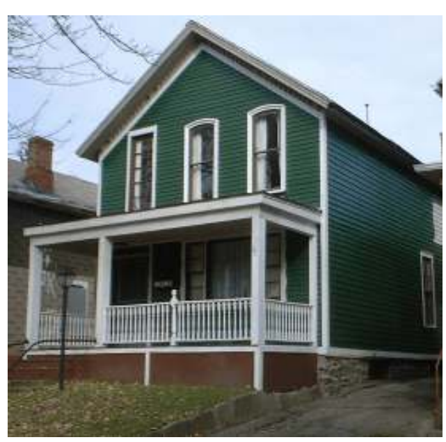
21 Plymouth Avenue

Address: 21 Plymouth Ave. Style: Gabled Italianate