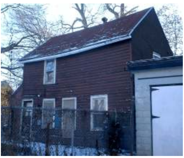
299 Pennsylvania Street, Carpentry Shop in Rear