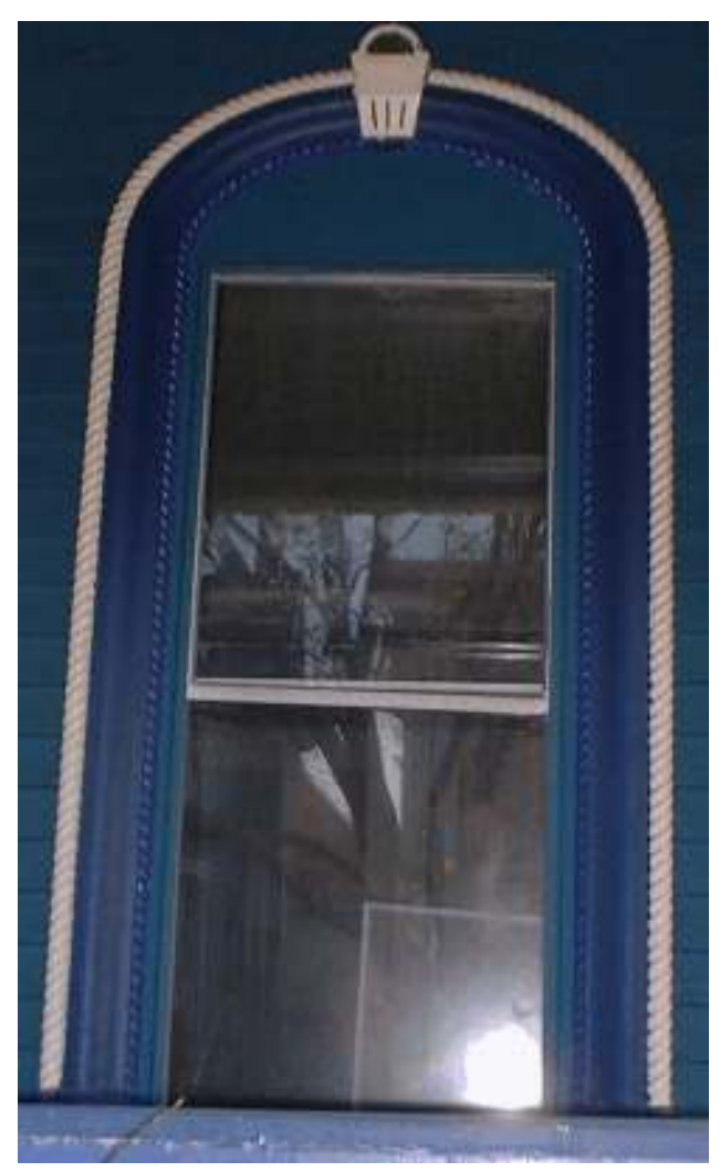
299 Pennsylvania Street, Window Detail