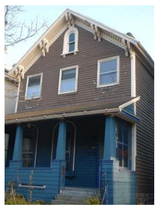
299 Pennsylvania Street

Permit: PCC 1890 P672. Olivia Byers to repair frame house by adding one story to rear part, size 14' x 24' on southerly side Pennsylvania Street, 118' west from Plymouth Ave.