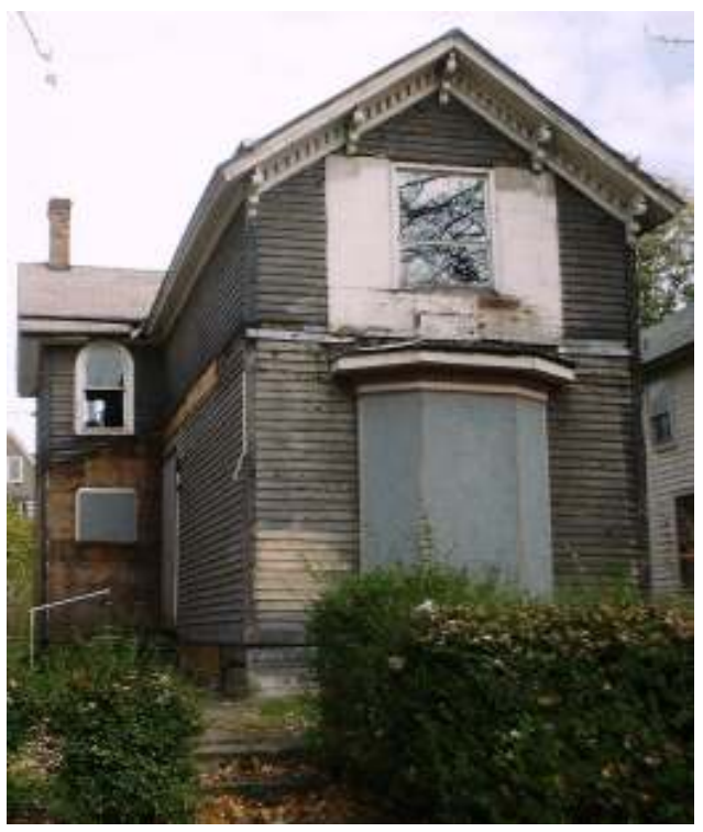
23 Plymouth Avenue prior to 2007 remodeling.

Permit: PCC 1872 P875. H.E. Spencer to erect a frame building, 16 x 20 in the rear of his house on Twelfth Street and known as 161.