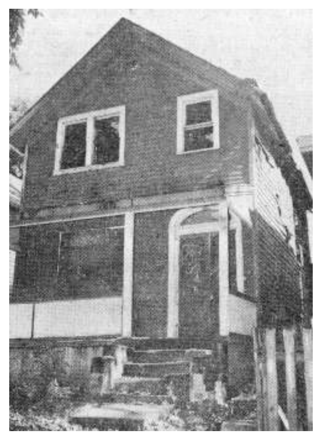
29 Plymouth Avenue, 1967 prior to demolition.