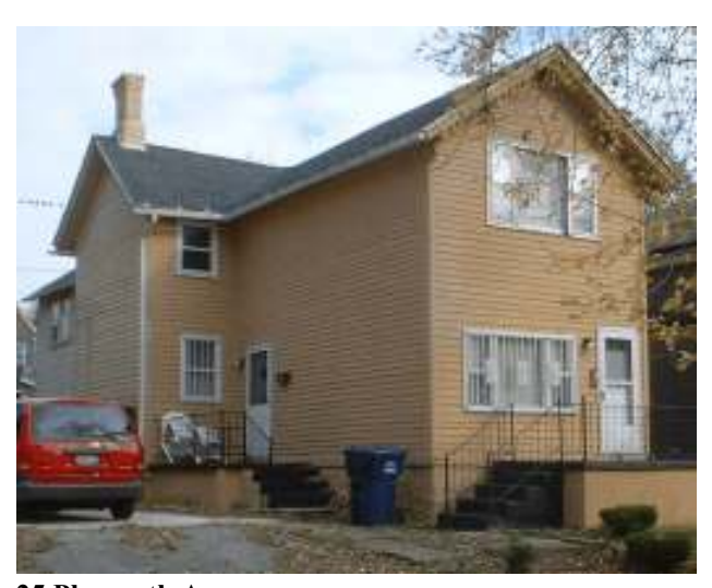
25 Plymouth Avenue

Address: 25 Plymouth Ave. Style: Gabled Italianate "L"