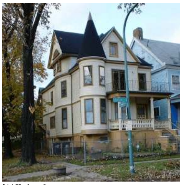
314 Hudson Street

Address: 314 Hudson St. Style: Queen Anne Construction: Frame