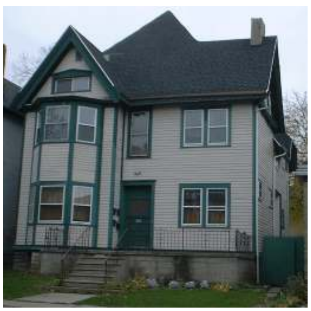
293 Pennsylvania Street

Construction: Brick Exterior: Brick Built: Circa 1880