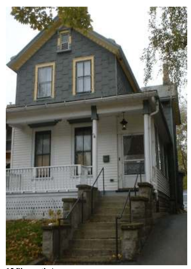
15 Plymouth Avenue

Address: 15 Plymouth Ave. Style: Gabled Italianate "L"