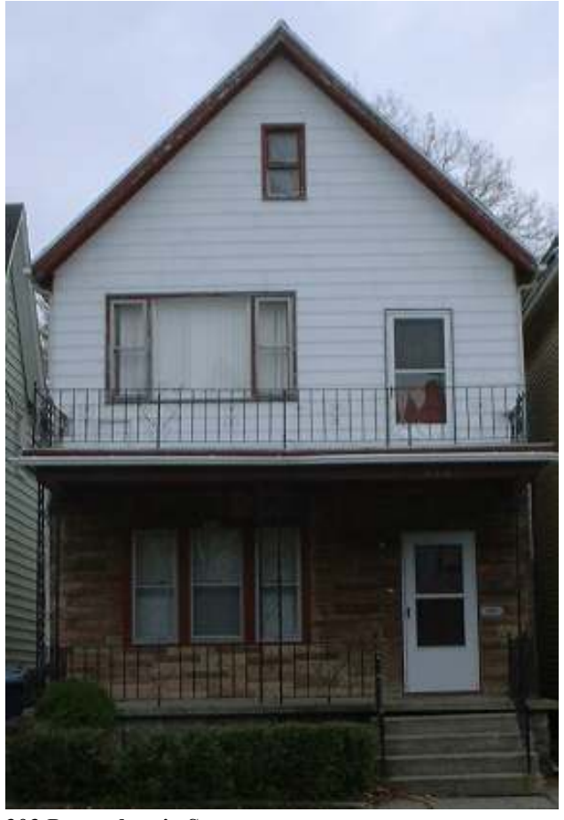
303 Pennsylvania Street

Caudell to Wells, SE line Penn. 59½ feet west of Plymouth, lot size 29 x 99, block 75.