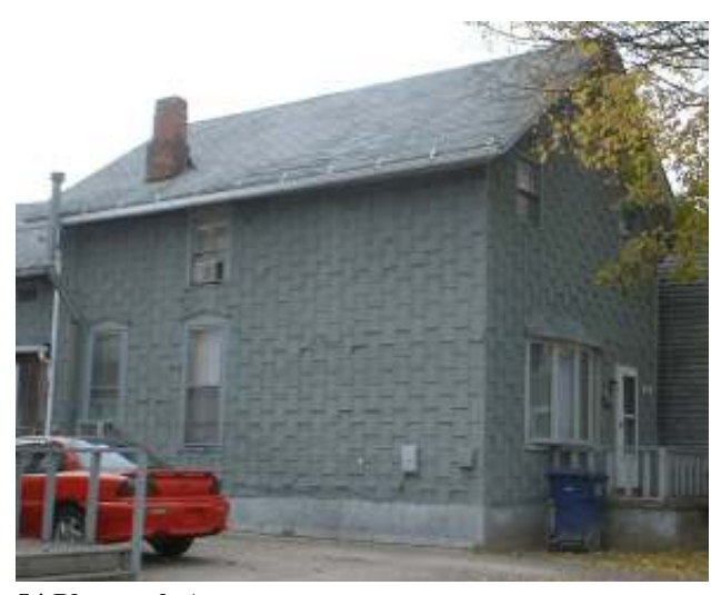
54 Plymouth Avenue

Address: 54 Plymouth Ave. Style: Worker's cottage