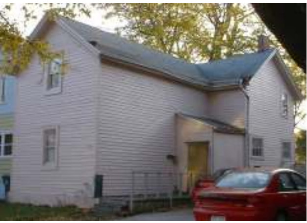
50 Plymouth Avenue

Permit: PCC 1935 P1577. George Puerner, convert to four (or three) family dwelling.