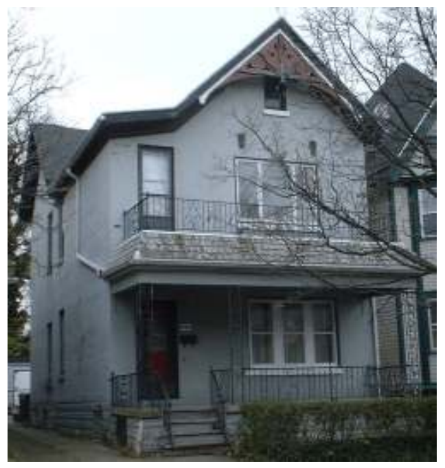
295 Pennsylvania Street