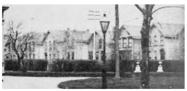
Plymouth Ave. Houses, circa 1885. 29 Plymouth Avenue is the last house on the right.

Address: 29 Plymouth Ave. Style: Gabled Italianate