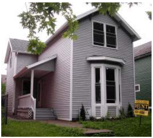
23 Plymouth Avenue after 2007 remodeling.