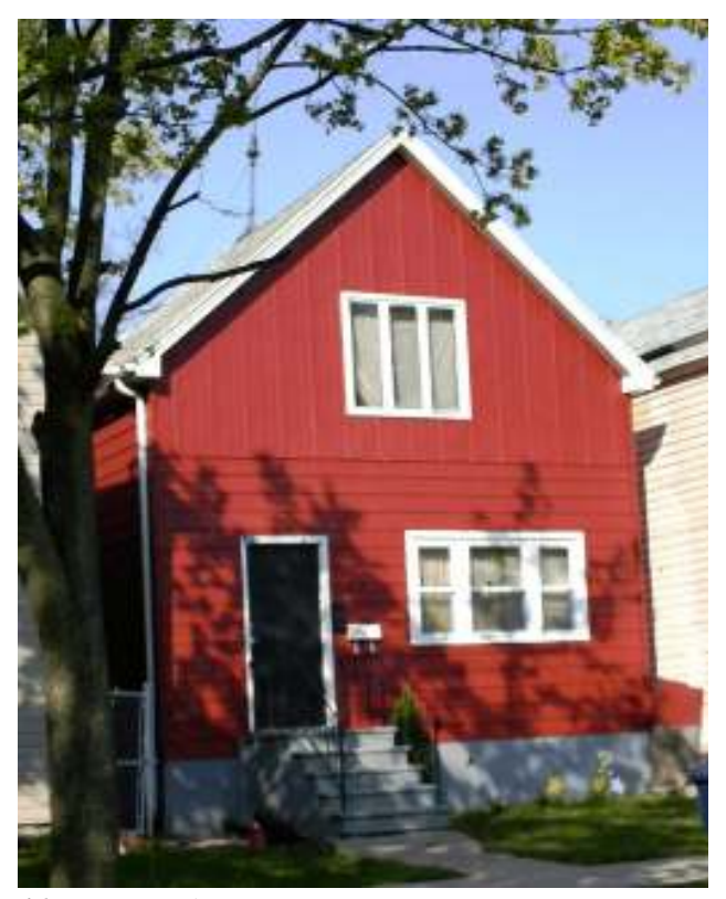
46 Plymouth Avenue

Address: 46 Plymouth Ave. Style: Worker's cottage