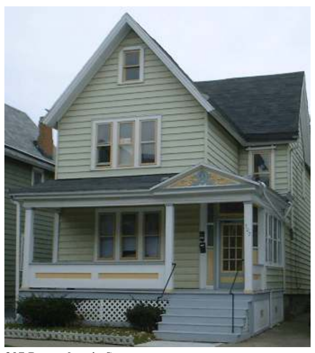
307 Pennsylvania Street

Permit: PCC 1882 P100. R. Caudell, frame building on southerly side of Pennsylvania Street, 34 feet westerly from Plymouth Avenue.