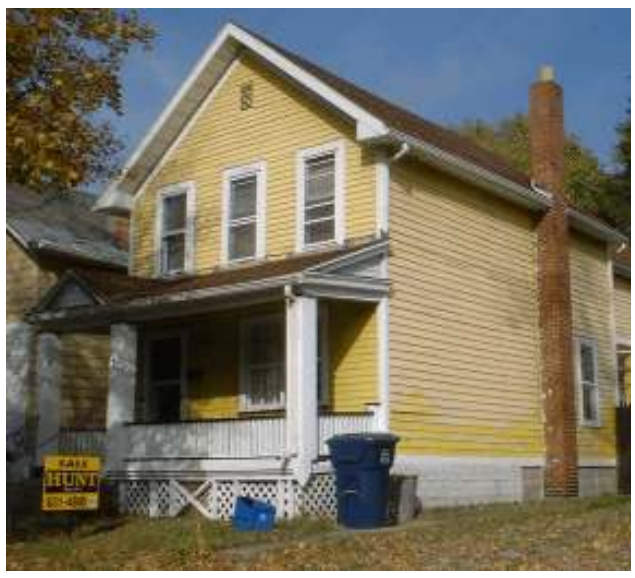
31 Plymouth Avenue

Address: 31 Plymouth Ave. Style: Gabled Italianate