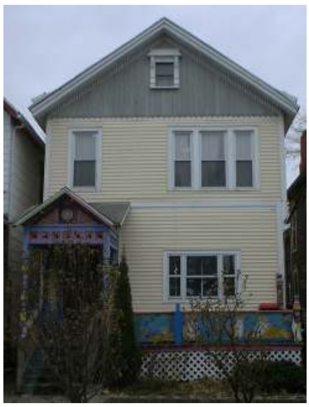
301 Pennsylvania Street

Address: 301 Pennsylvania St. Style: Gabled Italianate