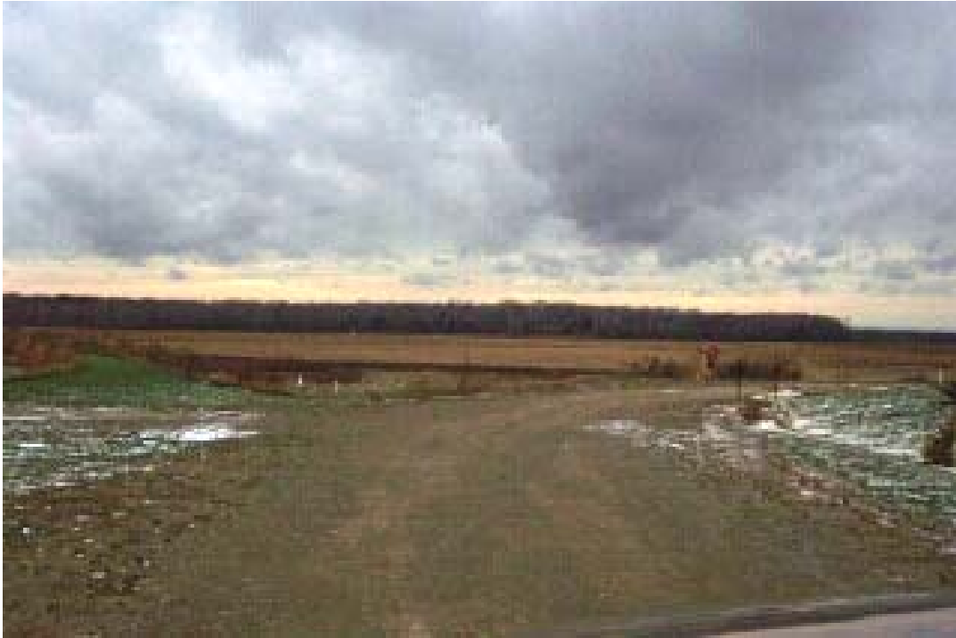
Figure 1-11. View of Lake Escarpment from Portage Road (NY 394), west of terminus of Parker Road, in Chautauqua, facing north-northwest.