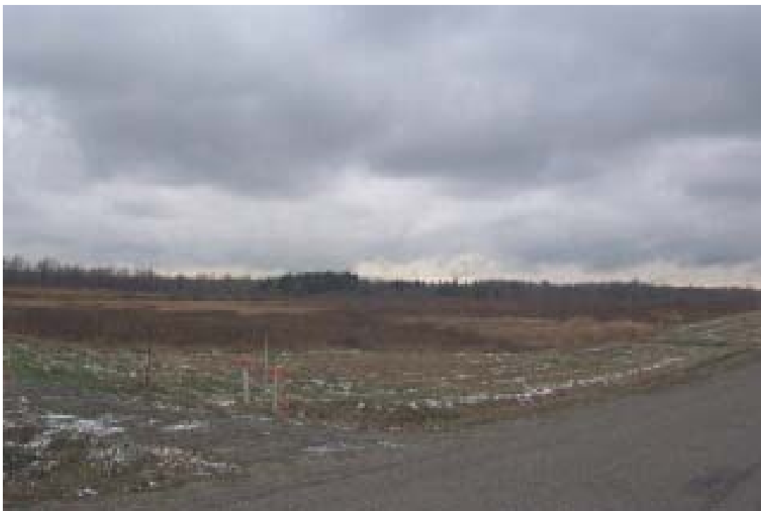
Figure 1-6. View from the top of the Lake Escarpment from Douglas Road, near Volusia Cemetery in Westfield (T), facing northwest.