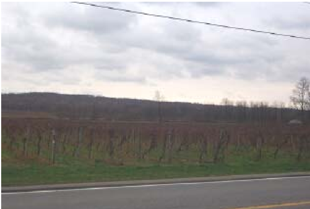
Figure 1-4. View of Lake Escarpment from US Rte 20 in Ripley, just west of Cemetery Rd, facing southwest.