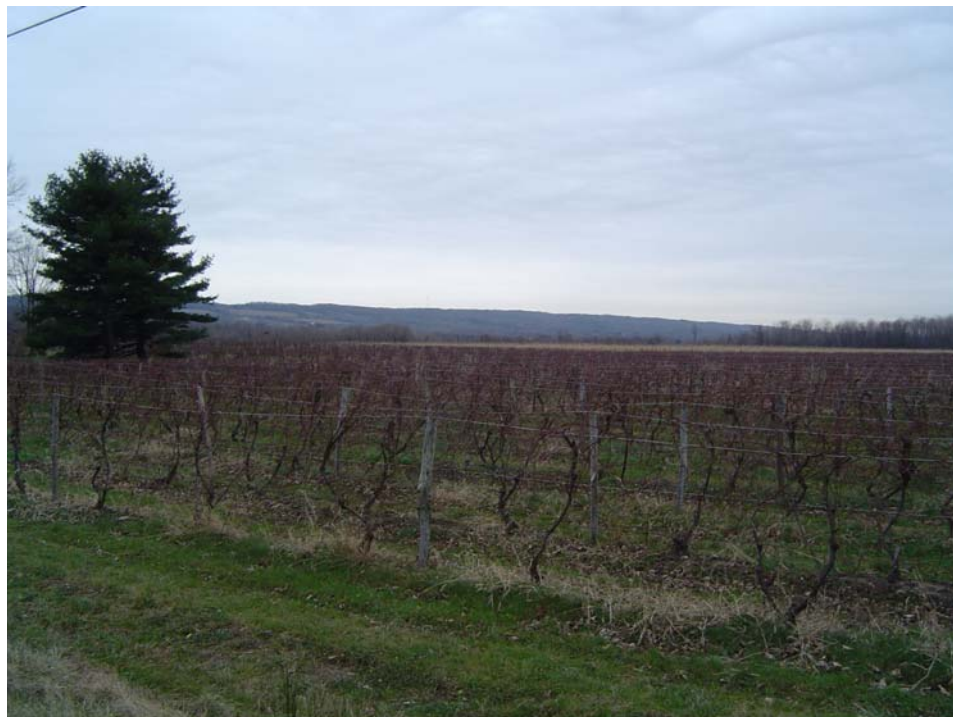
Figure 1-8. View of Lake Escarpment from near 31 South Gale Road, south of West Main Street (US 20), facing southwest from the western edge of Westfield Village.