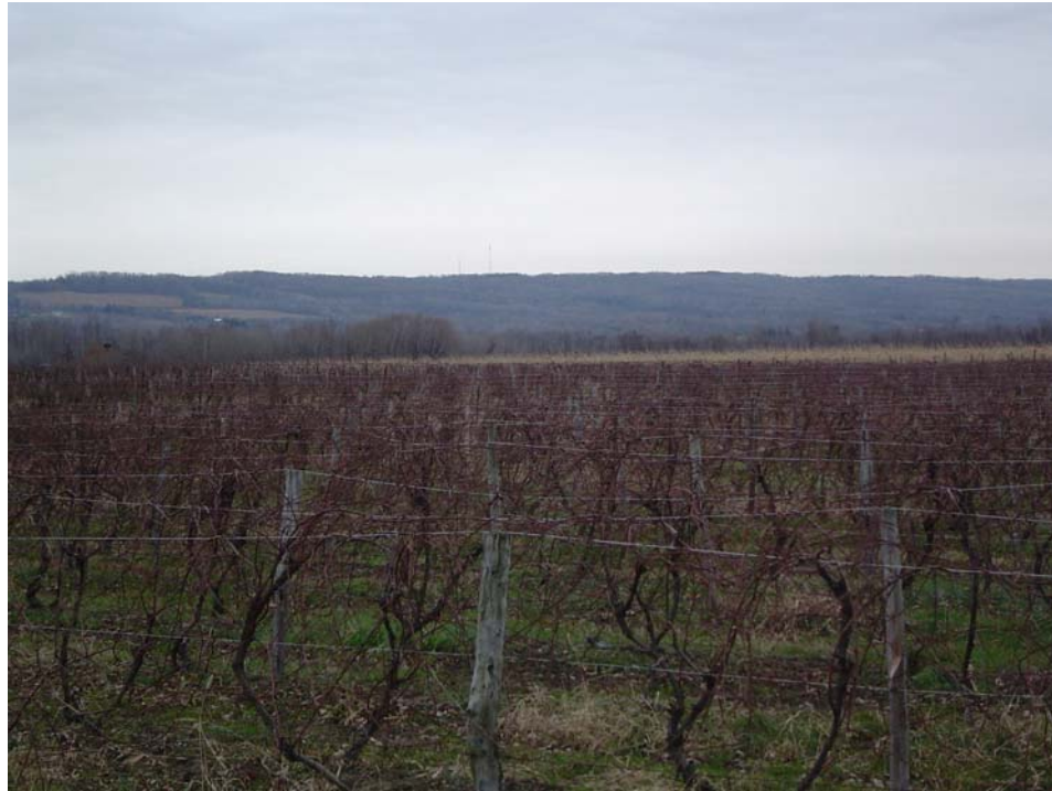
Figure 1-7. View of Lake Escarpment from North Gale Road, north of the railroad line, facing southwest from the western edge of Westfield Village.