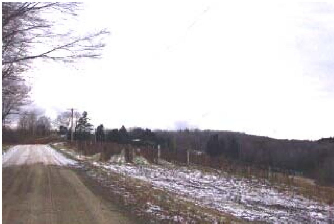
Figure 1-10. View of Lake Escarpment from Mount Baldy Road in Westfield (T), facing west.