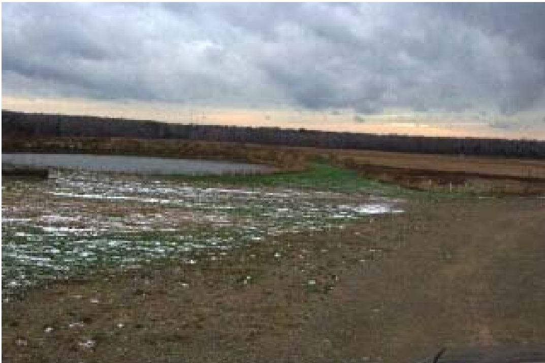
Figure 1-12. View of Lake Escarpment from Portage Road (NY 394), west of terminus of Parker Road, in Chautauqua, facing west.