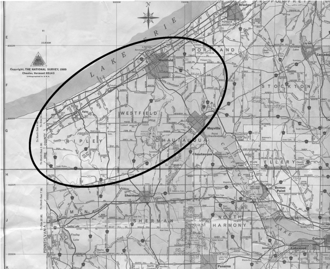
Figure 1-1. General location of the Chautauqua Windpower Project Zone of Visual Influence (ZVI) in southwestern Chautauqua County, New York. Note: Pennsylvania border at left.