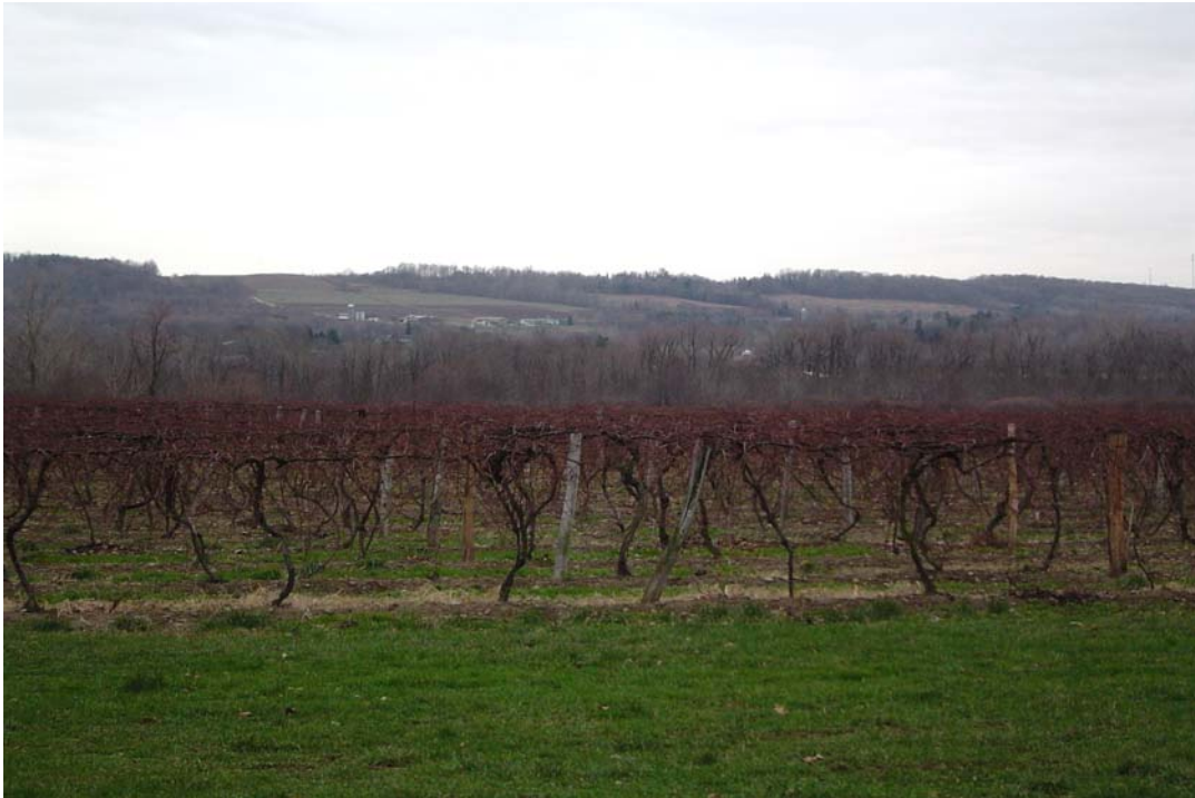
Figure 1-9. View of Lake Escarpment from south of 31 South Gale Road, south of West Main Street (US 20), facing south-southwest from the western edge of Westfield Village.