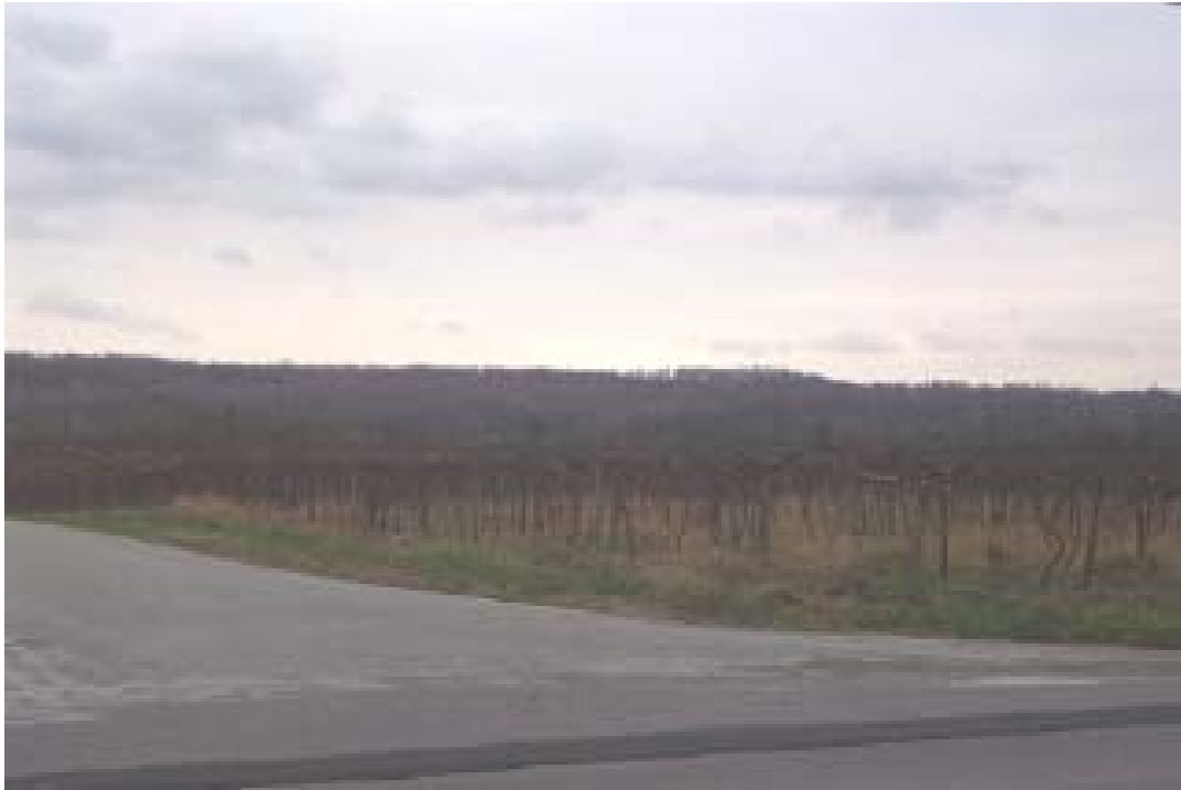
Figure 1-3. View of Lake Escarpment from US Rte 20 in Ripley, at Brockway Rd., facing south-southwest.