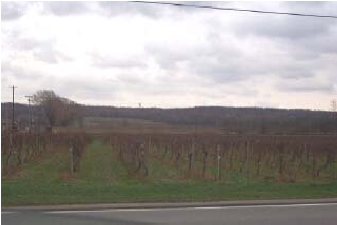
Figure 1-5. View of Lake Escarpment from US Rte 20 in Ripley, just west of Cemetery Rd, facing south.