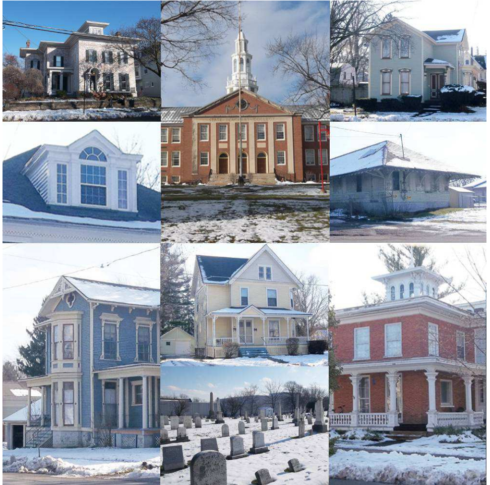
This project is funded by a Certified Local Government (CLG) Grant

Prepared for the Village of Brockport Historic Preservation Commission by: