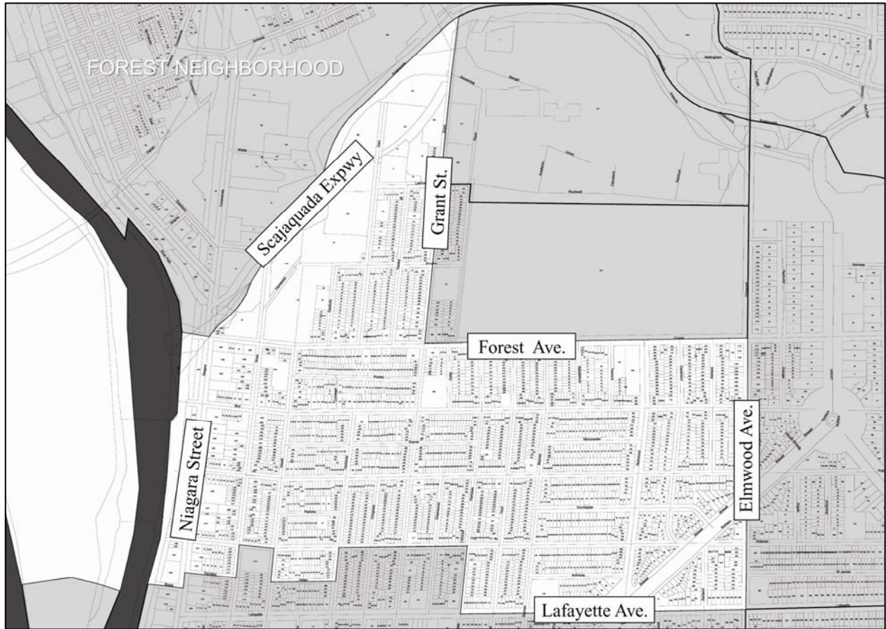
Figure 1-3. Forest neighborhood, Buffalo, New York (City of Buffalo Office of Strategic Planning, 2003)