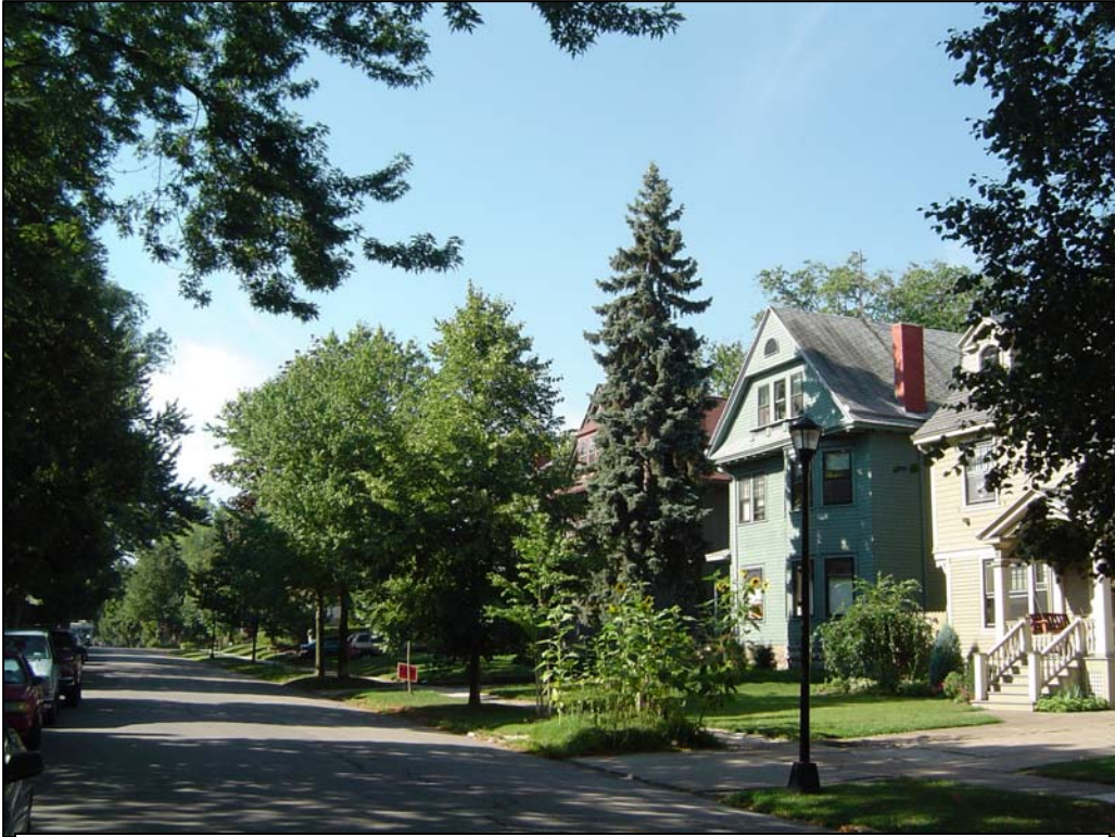
Figure 4-3. Ashland Avenue west side streetscape, looking south from Bidwell Parkway.