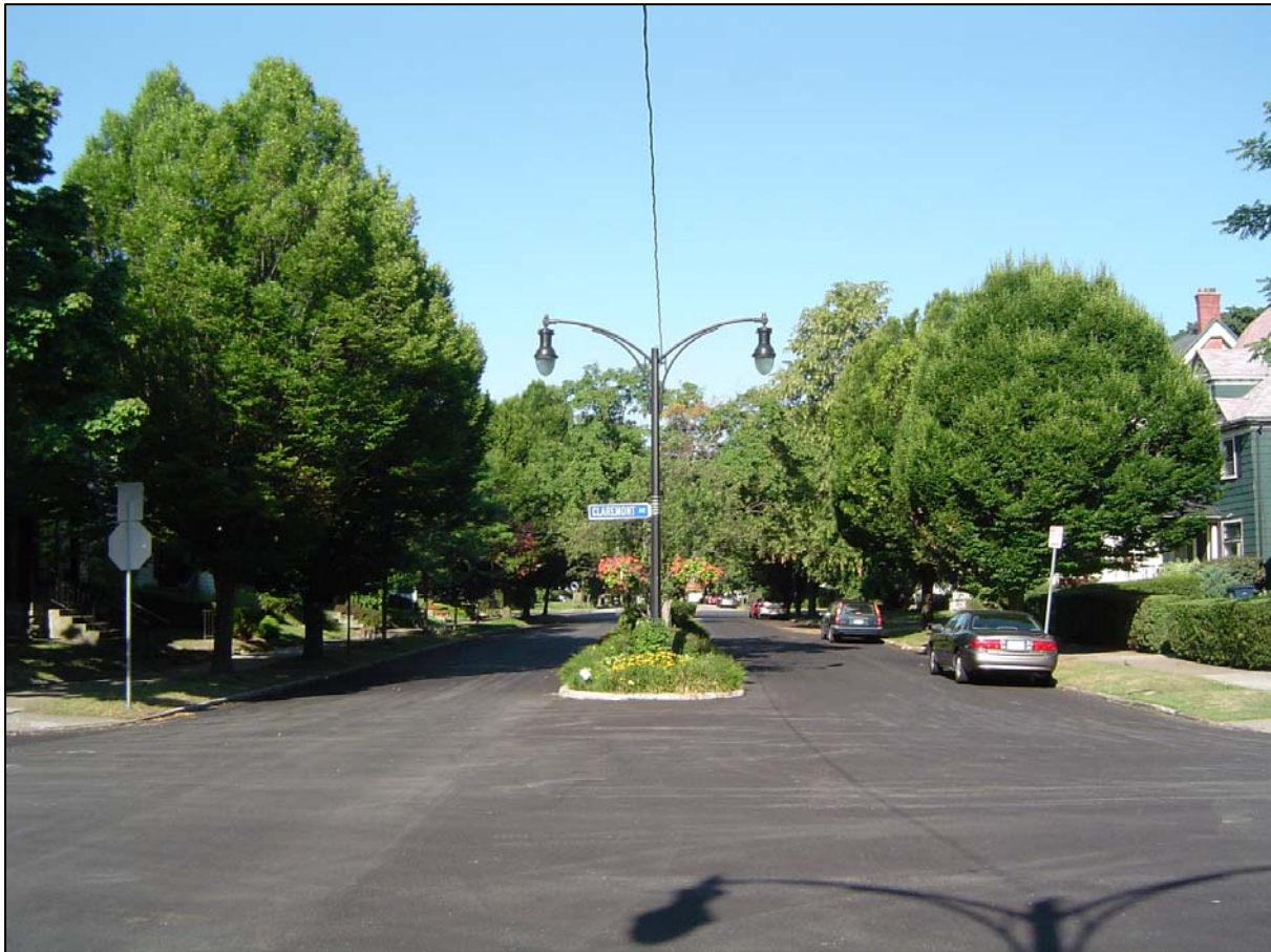
Figure 4-17. Dorchester Road, looking west from Claremont Avenue.