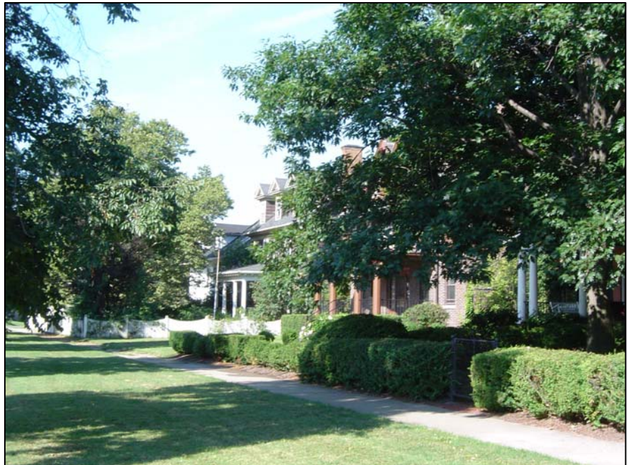
Figure 4-10. Northwest side of Colonial Circle.