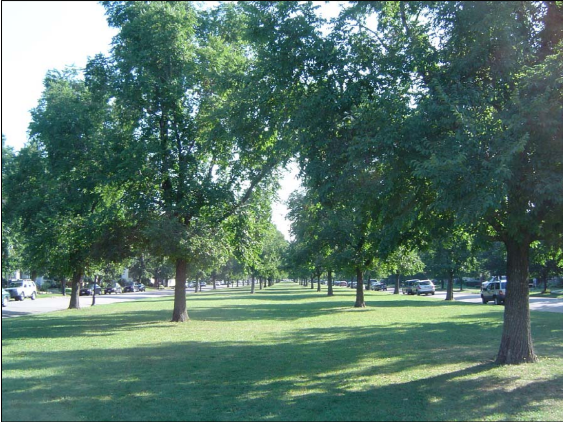
Figure 4-13. Looking northwest along the large tree lined lawn median that bisects Bidwell Parkway