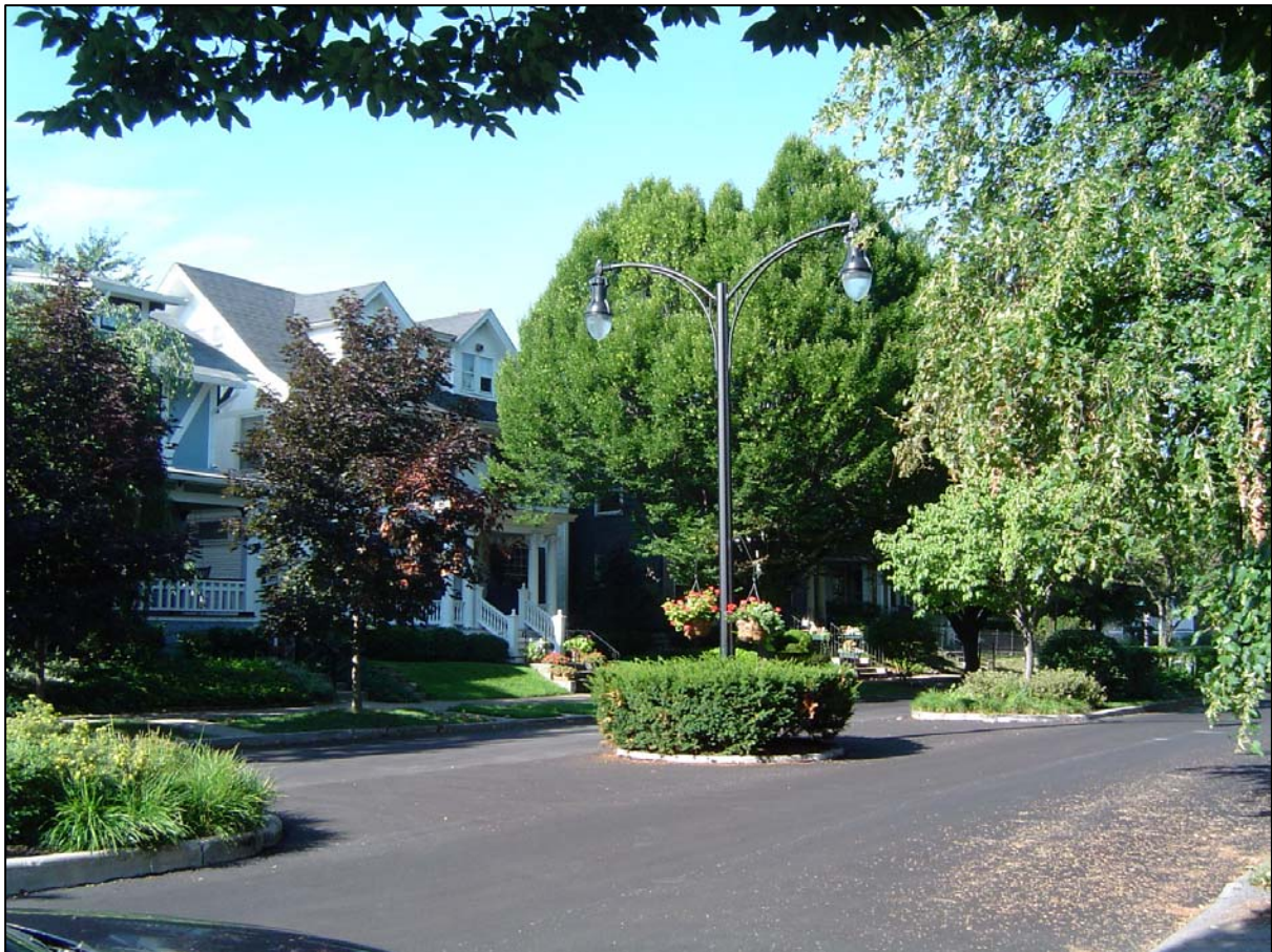
Figure 4-16. Dorchester Road, south side streetscape.