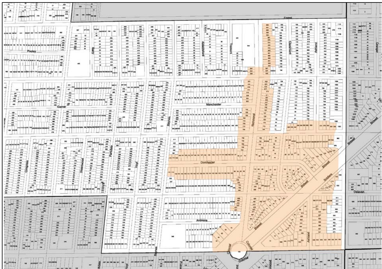
Figure 4-1. Forest neighborhood : Richmond Avenue-Ashland Avenue Historic District shaded orange.

The Richmond Avenue-Ashland Avenue Historic District is comprised of 646 properties. This includes 506 contributing elements and 140 non-contributing elements. The district boundaries are: to the south, the southern edge of parcels located on the south side of West Ferry Avenue; to the north, the northern edge of parcels located on the north side of Potomac Avenue, then extending up only Richmond Avenue to Claremont Avenue; to the west, the eastern edge of properties located on the east of Richmond Avenue, with the inclusion of the full length of both sides of Dorchester Road; and to the east, the eastern edge of properties on Ashland Avenue at the eastern end of the district that abut lots fronting Elmwood Avenue (Figure. 4-1,2). The district is located along the length of the far east portion of the Grant-Ferry-Forest neighborhood.