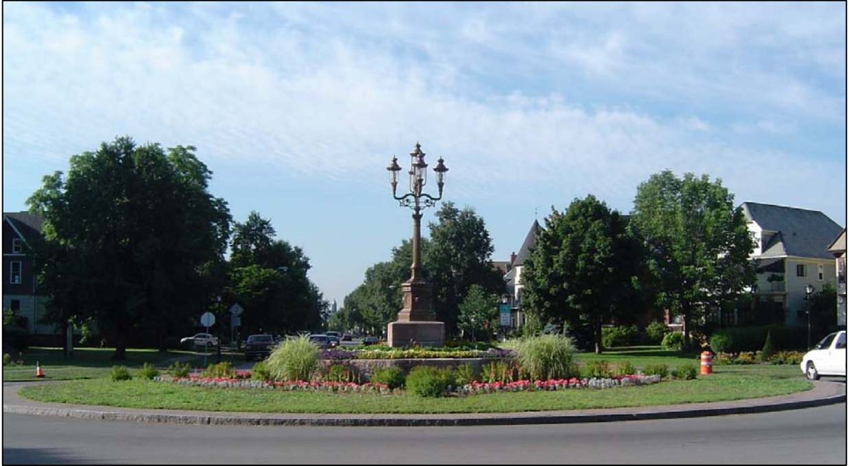
Figure 4-7. Ferry Circle looking south from Richmond Avenue