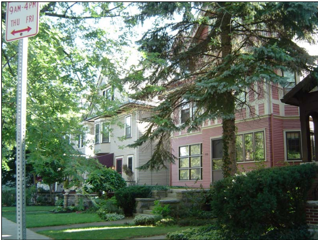
Figure 4-4. Ashland Avenue east side streetscape, looking north from Lafayette Avenue.