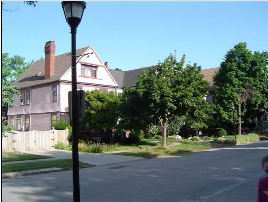
Figure 4-5. West side streetscape of Norwood Avenue from the corner of West Ferry Avenue.