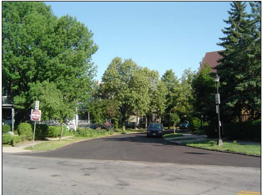
Figure 4-15. Claremont Avenue, looking north from Bidwell Parkway.