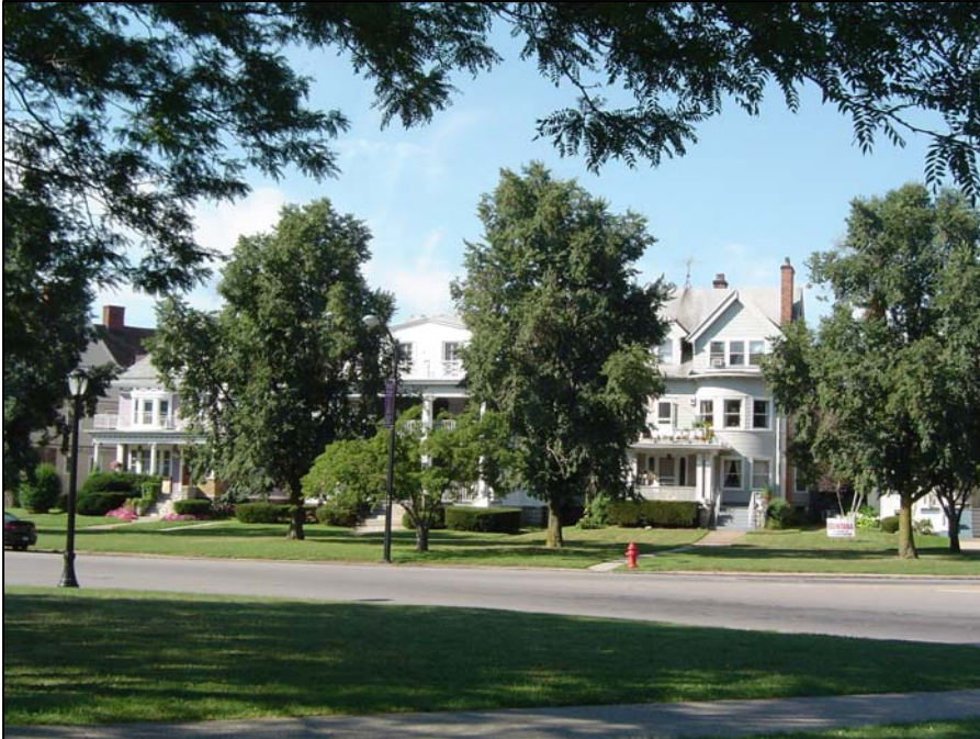
Figure 4-11. Southwest side of Colonial Circle.