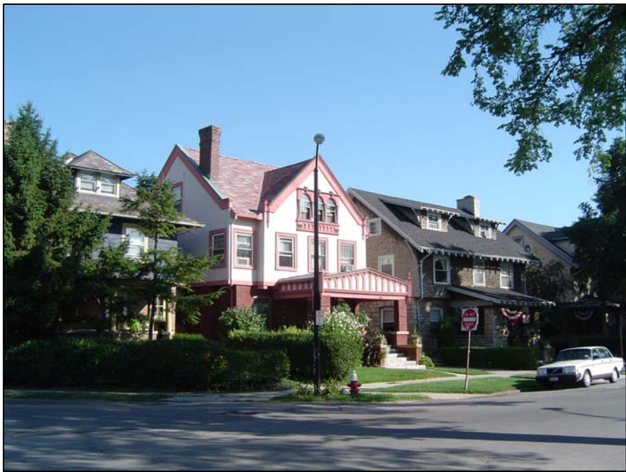
Figure 4-14. North side of Bidwell Parkway near Claremont Avenue.