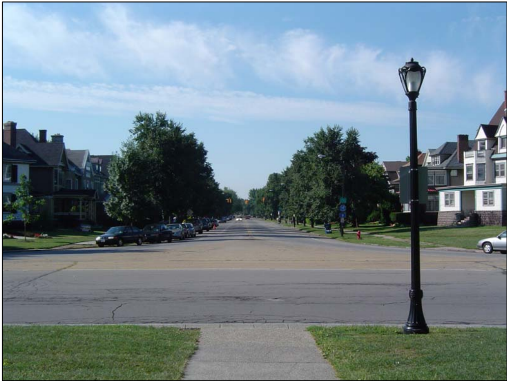
Figure 4-8. Richmond Avenue looking south, between Ferry and Colonial Circle.