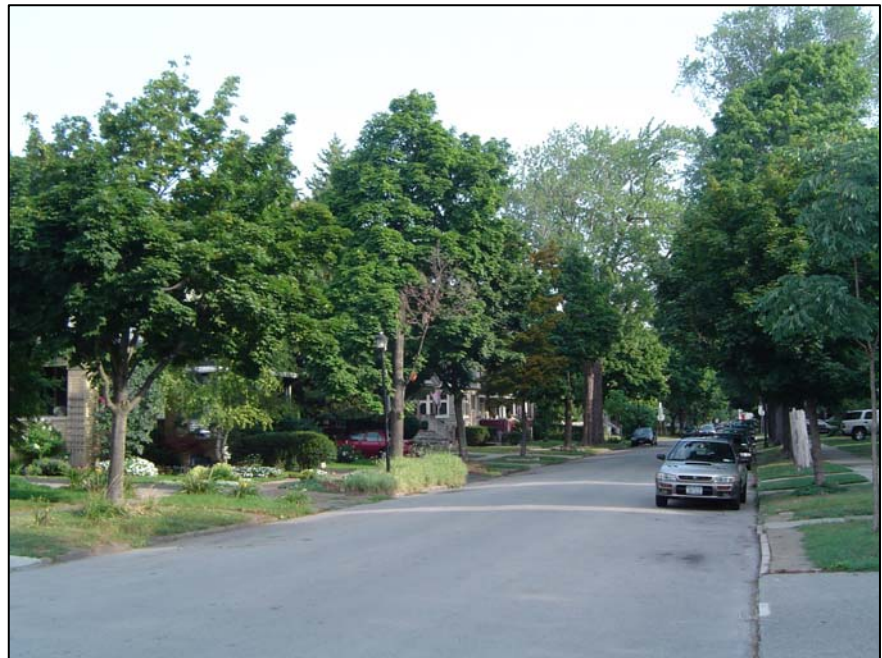
Figure 4-6. Norwood Avenue, looking north from West Ferry Avenue.