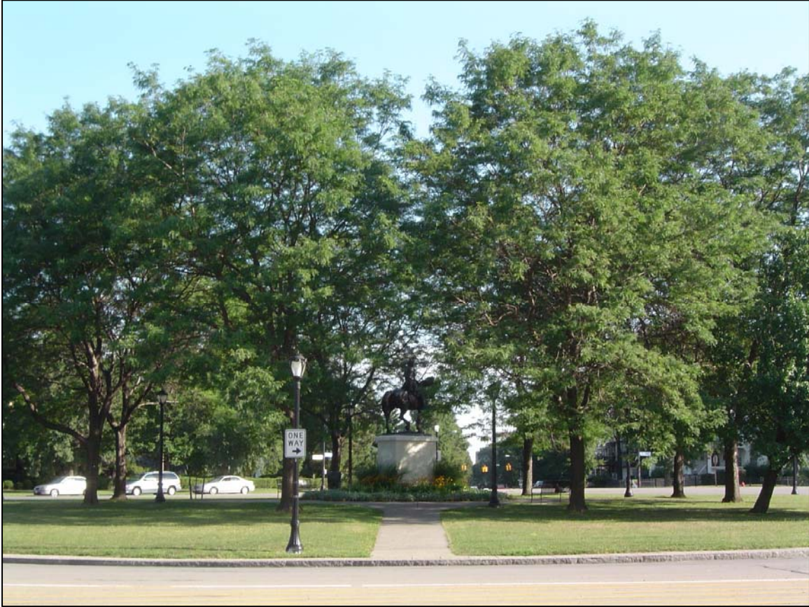
Figure 4-9. Colonial Circle, looking north up Richmond Avenue.